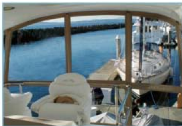
See Ray 480