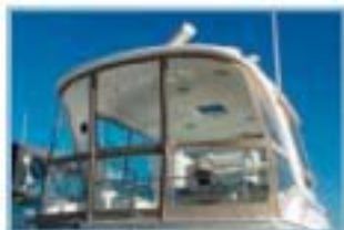
See Ray 480