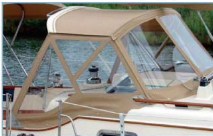
Island Packet 40

UV PROTECTION. Rainier Windows screen 98-100% of the sun's harmful UV rays, protecting you, valuable instrumentation and interiors.